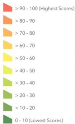
CalEnviroScreen 4.0 Results