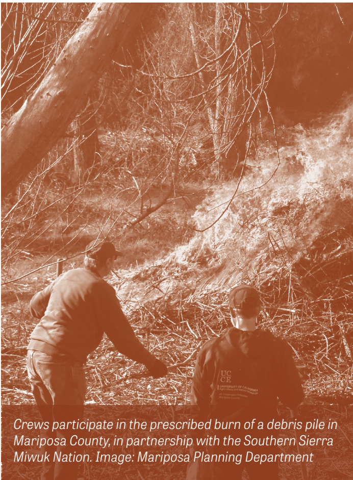
Crews participate in the prescribed burn of a debris pile in Mariposa County, in partnership with the Southern Sierra Miwuk Nation.

The Mariposa Creek Parkway Master Plan also integrated TEK into one of its priority projects, which is to address the removal of invasive species, especially the Himalayan Blackberry and Tree of Heaven. Rather than exclusively relying on potentially harmful pesticides, the invasive species removal program employs TEK to treat invasive species and prime the Creek corridor for revegetation with native species. Through a partnership led by the American Indian Council of Mariposa County, project leaders will use both conventional fire prescriptions and traditional practices which Indigenous land managers have implemented for centuries to manage the foothills landscape. Not only are these methods proven to be successful, but they are also a significant part of the region's heritage and identity, making the prescribed burn program a unique opportunity for creative placemaking and storytelling. TEK and prescribed fire are also priority activities carried forward in the countywide CWPP.