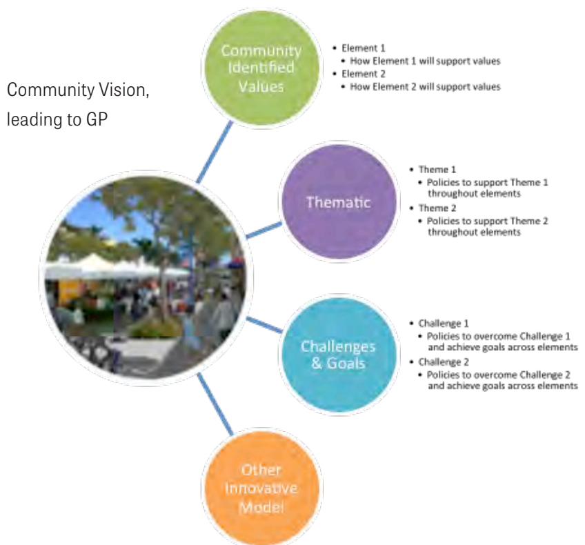
Figure 1: Examples of General Plan Layout

The term “element” refers to the topics that California law requires to be covered in a general plan ( Gov. Code § 65302 ). There is no mandatory structure or maximum number of elements that a general plan must include. Once added into the general plan, each element, regardless of statutory requirement, assumes the same legal standing, and must be consistent with other elements ( Gov. Code § 65300.5 ). The general plan is the perfect space for innovation, reflecting the unique character of each community. The format and content of general plans can vary between jurisdictions. Planners must address mandatory elements, but they have discretion to organize general plans by values (core concepts that the community